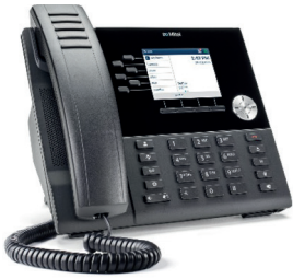
MIVOICE 6920 IP PHONE