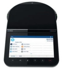
MIVOICE CONFERENCE PHONE