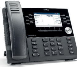
MIVOICE 6930 IP PHONE