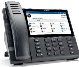
MIVOICE 6940 IP PHONE